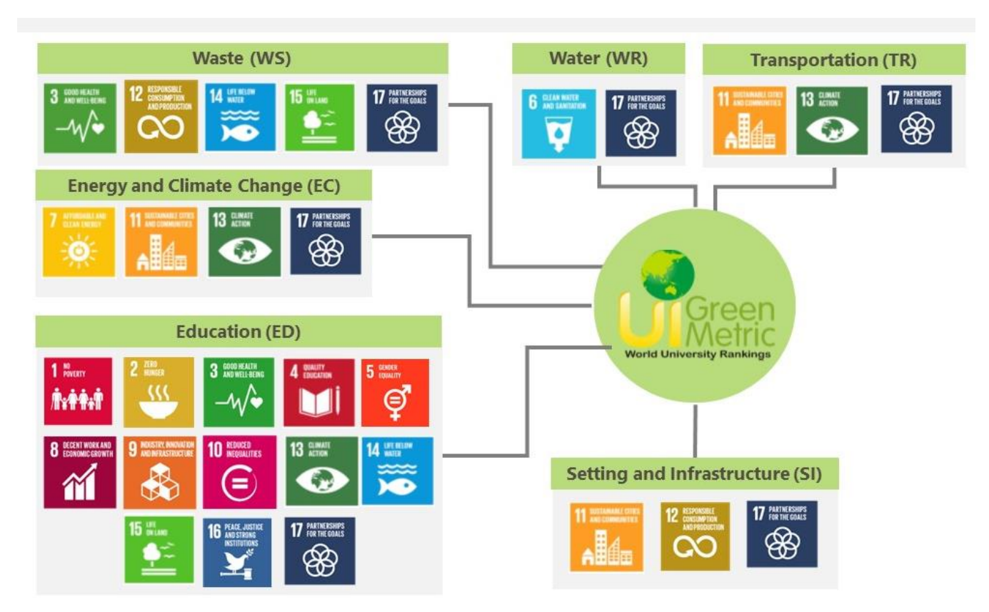
Figure 1. UI GreenMetric and SDGs

UN Environment's challenge in the 2030 Agenda is to develop and enhance integrated approaches to sustainable development – approaches that will demonstrate how improving the health of the environment will bring social and economic benefits. Aiming at reducing environmental risks and increasing the resilience of societies and the environment as a whole, UN Environment action fosters the environmental dimension of sustainable development and leads to socio-economic development (UNEP, n.d.). These 17 aspects in SDGs are captured in the UI GreenMetric criteria and indicators.